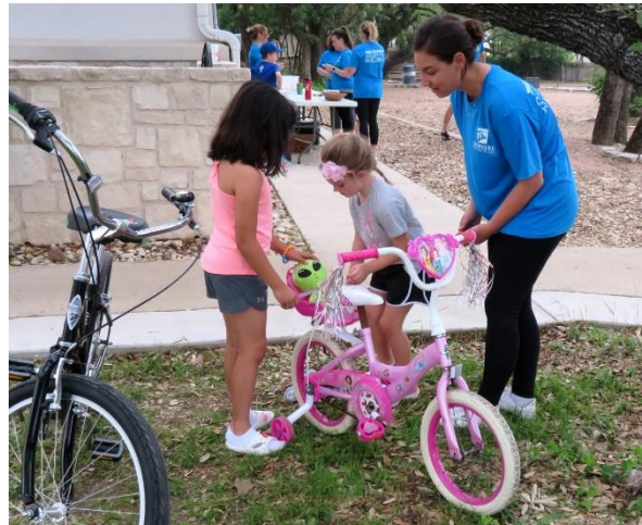
PEDALS & PETALS