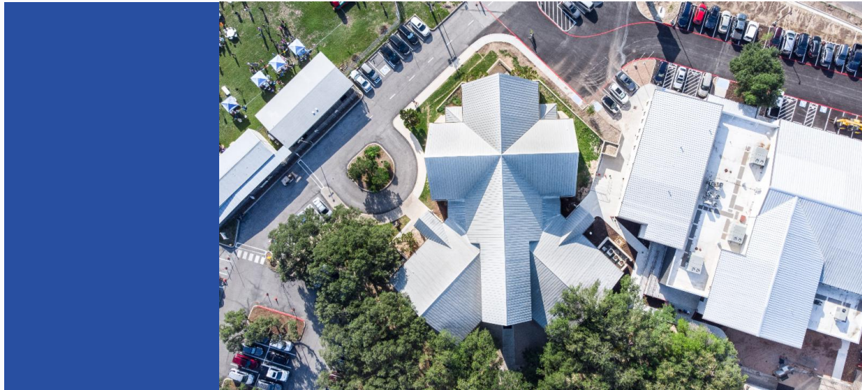
Shepherd of the Hills Lutheran Church, School, & Child Care