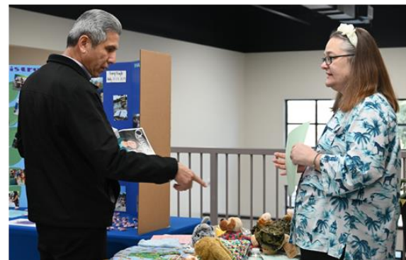
Ministry Showcase 2024